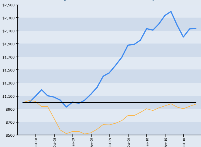
— Front Street Small Cap Fund Series A — S&P/TSX Small Cap Total Return Index